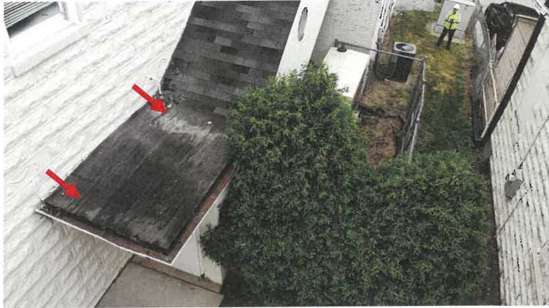
The Village Hall Building (W02):